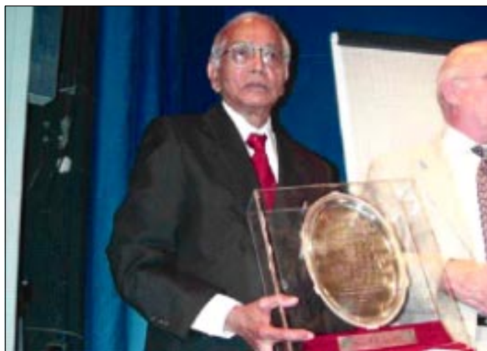
Prof. C. R. Rao with the first international Award in Statistics instituted by Govt. of India in memory of Prof. P. C. Mahalanobis